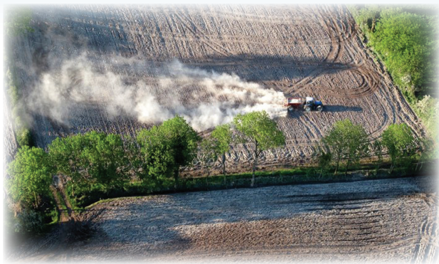
Ag-lime application helps provide environmental benefits as well as increased crop yields.

F armers apply ag-lime to neutralize soil acidity, to reduce the risks of aluminum (Al) toxicity ... and for a host of other beneficial reasons. Ag-lime improves the physical, chemical, and biological conditions of soil. It increases crop growth, which results from improved nutrient and water use. Improved crop growth helps protect the soil from wind and water erosion. Adequate liming enhances fertilizer nutrient efficiency and the effectiveness of some herbicides.