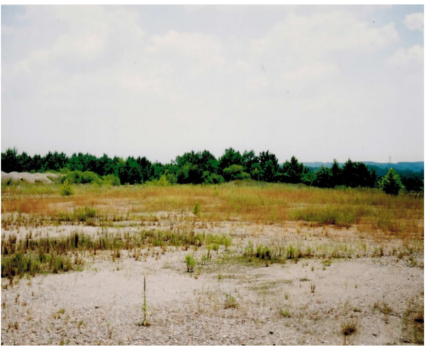
Figure 4-3. Open area between the processing area and the plant berm

An increased emphasis on reforestation at aggregate plants provides further benefits for carbon capture. Tree planting in conventional locations such as facility berms and plant entrances can be expanded. Many facilities have large buffer areas as shown in Figure 4-3 between the processing equipment and adjacent neighbors. As long as the area is not above future reserves, more trees can be planted for CO2 capture.