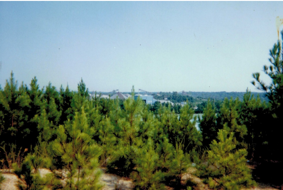
Figure 4-1. Crushed stone plant surrounded by reforested area, 1997.

Reforestation of open land at aggregate industry plants continues to be a core element of environmental stewardship. Trees, such as those shown in Figures 4-1 and 4-2, provide significant environmental benefits by reducing noise and light from affecting nearby neighbors. Trees provide habitat for wildlife and improve aesthetics.