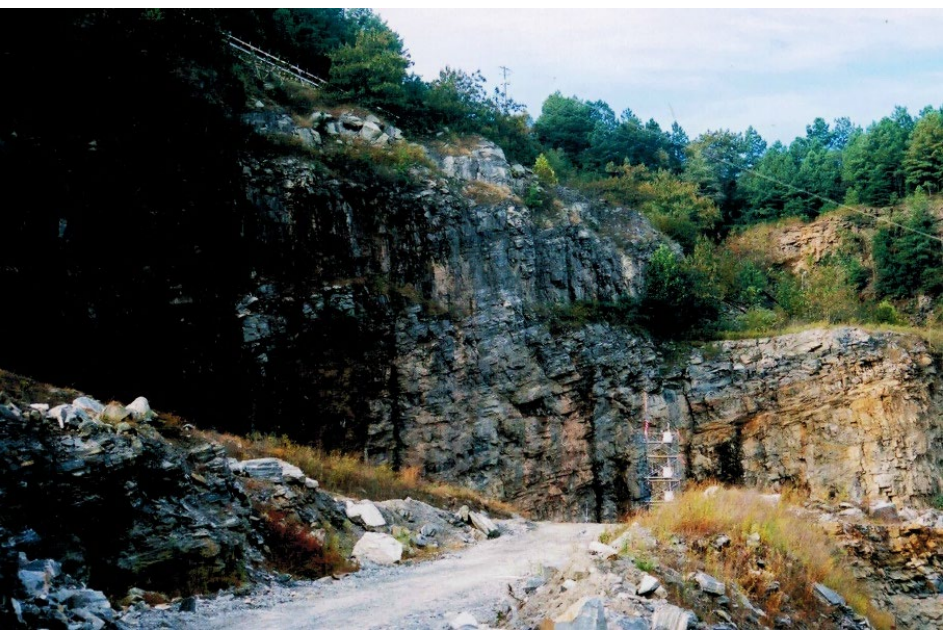
Figure 4-2. Trees surround a quarry pit and quarry haul road, 1997